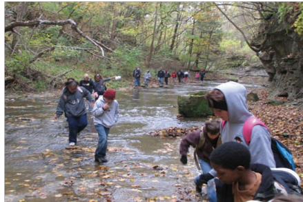
Crossing a stream

and there was a whole bunch of fluffy milkweed seeds inside (Anjanaya). The seeds looked like mouse poop and the top looked like white fuzz. We planted the seeds in a place where the lawn mower could not get them (Billy). On